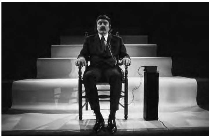
Figure 7. Photograph of a videotaped performance of Alvin Lucier's Music for Solo Performer at Wesleyan University, Middletown, CT, 1975 (first performed in 1965), from episode 3 of Robert Ashley's television production Music with Roots in the Aether (1976).

aesthetic potential of biofeedback became apparent in the US in the mid-1960s as artists established collaborations with scientists to track changes in mental states by pairing variations in brain frequency with sensorial stimuli. In musical composition, ideas of biofeedback took firmer roots than in the visual arts. 29 This is easily explainable given the fact that most aesthetic experiments with this technology were geared toward the production of alpha waves, which generally cannot be produced while performers focus on visual stimuli. In 1965, Alvin Lucier created Music for Solo Performer after finding out about the direct correlation between the emergence of alpha brain waves and the transition into meditative states (fig. 7). With electrodes connected to his head, Lucier stood on the stage, waiting for his neural oscillations to reach the alpha threshold (13 Hz), at which their signal would be amplified and transmitted through loudspeakers to a set of percussive instruments echoing its vibrations. 30