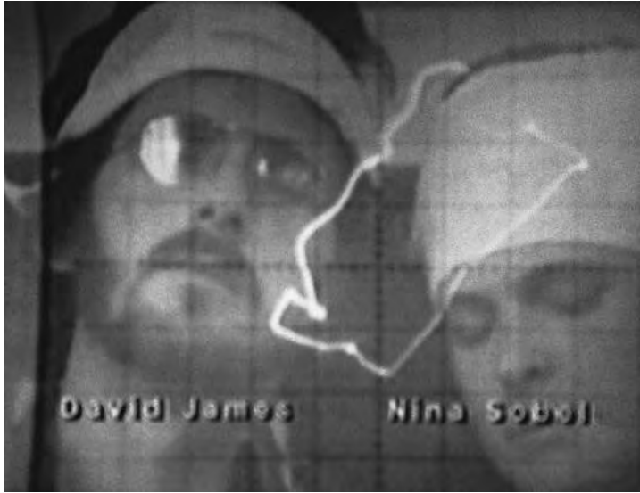
Figure 2. Nina Sobell, Brainwave Drawings (1974–), screenshot from video documentation of interaction with the installation.

otherwise imperceptible communicative acts established between their brains. Gradually, all associations with a medical examination gave way to participants' immersion in a meditative experience. On the screen, they could watch a live video broadcast of themselves as well as a pair of wavy lines oscillating in conjunction with the rhythmic activity of their respective neural systems. At times the images would become suffused with intense color tones, which were randomly produced despite visitors' conviction that they could influence them via their mental activity. 3 The cybernetic circuit established across participants' bodily thresholds alerted them to the contingent nature of mental activity modeled by interactions with others. In some instances, participants could observe the convergence of the vibrating lines into a full circle, which denoted a temporary synchronization between their brains' rhythms (fig. 2). Their access to a double layer of visual information, encompassing both their body language observable via the video interface and the abstract signs of their neural activity,