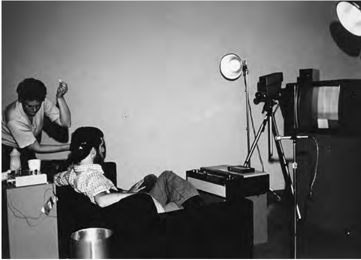
Figure 1. Nina Sobell, EEG: Video Telemetry Environment (also known as Brainwave Drawings , 1975), installation at the Contemporary Arts Museum, Houston.