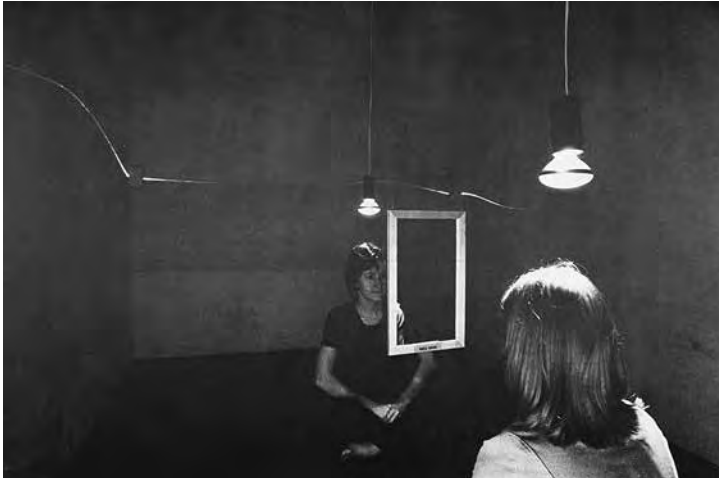
Figure 9. David Rosenboom, Vancouver Piece (1973), installation.

ings project is more closely aligned with Rosenboom's interpersonal approach to the use of biofeedback than to Lucier's and Hay's pieces. Sobell relinquished the role of performer, offering the opportunity to museum visitors to experience the aesthetics of biofeedback as they watched their video images. Given the fact that Brainwave Drawings ' content is modeled by art participants' communication, the work foreshadows the relational art genre theorized by Nicolas Bourriaud in the 1990s to account for the proliferation of projects enacted through the formation of interpersonal relationships between visitors. 33