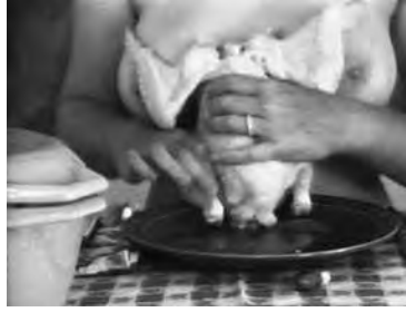
Figure 5. Nina Sobell, Hey, Baby Chicky! (1978), still from video performance, B&W.