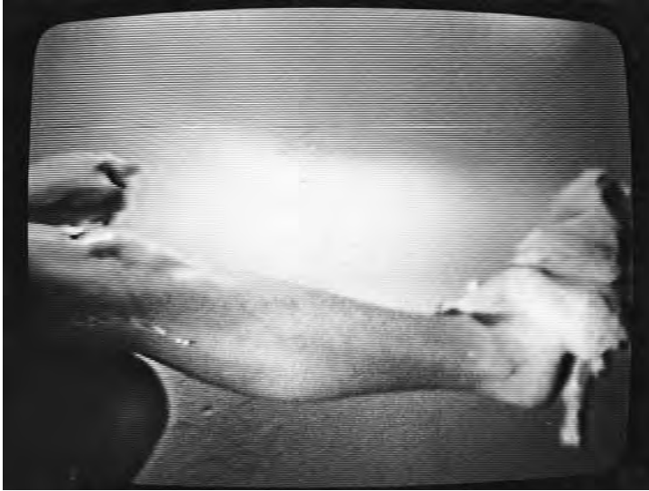
Figure 4. Nina Sobell, Chicken on Foot (1974), still from video performance, B&W.

Sobell enacts another absurd scenario with a chicken carcass in Hey, Baby Chicky! (1978), a video piece which even more blatantly unveils the paradoxes of the mother-infant relationship through a kitchen dance that sometimes verges on the macabre. To the upbeat tune of Wilson Pickett's "Midnight Hour," the artist unwraps a chicken package, alternatively transforming its limp body into a sexual object and a lively animal subject demanding attention and caresses. Through its humorous transgression of behavioral taboos, the piece resembles Wolfgang Stoerchle's video performances from the 1970s, which similarly challenge viewers to face their anxieties about sexuality. It is composed of four clearly delineated scenes in which the artist oscillates between the role of a woman unabashedly revealing her sexual desires and that of a mother whose body acquires a primarily nurturing function. 17 The third act of the performative interaction is the most conflicting one since the two roles overlap, prompting an encounter with the abject. As the music changes to Barbara Lewis's "Baby I'm Yours," Sobell makes a surprise appearance from beneath the table and