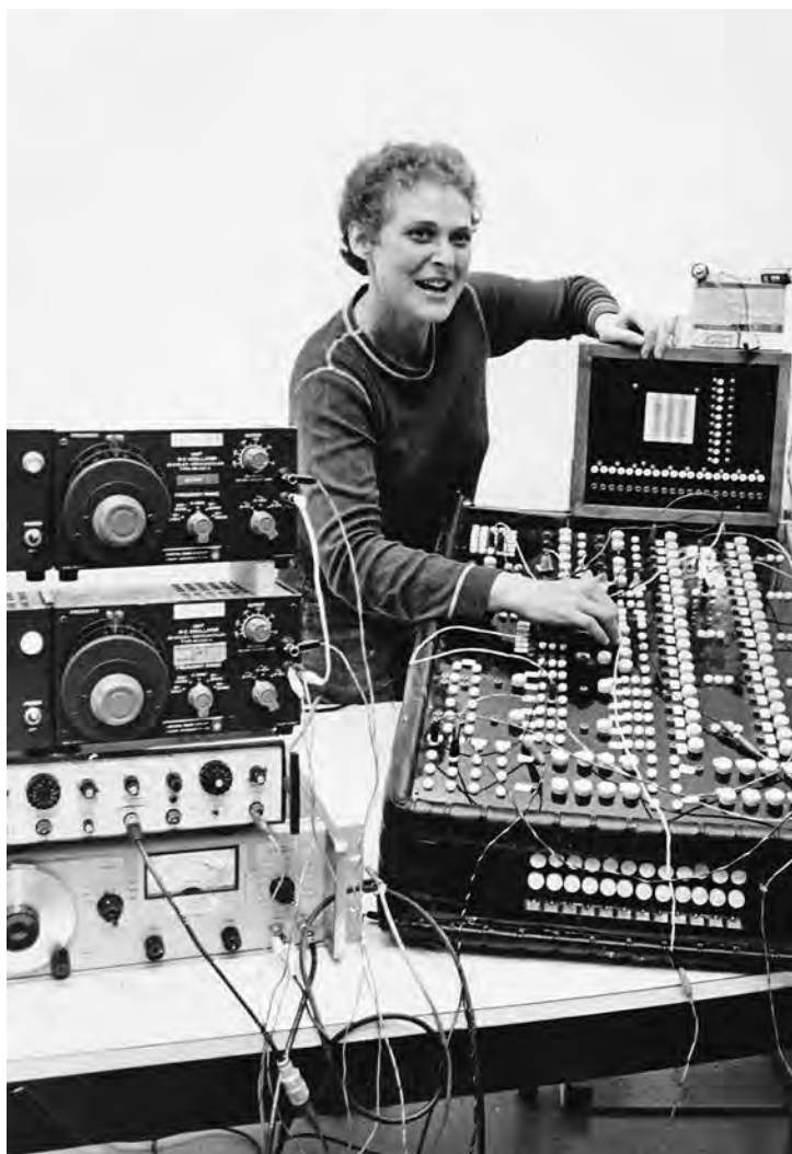
Figure 11. Nina Sobell, EEG: Video Telemetry Environment (1975).